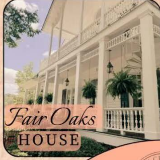
Fair Oaks HOUSE