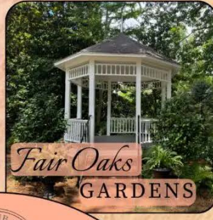
Fair Oaks GARDENS