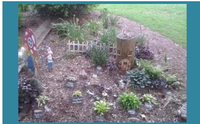
Fairy Garden at the Kennesaw Mountain Daylily Gardens.

Are you tired of selling tickets, doing fundraisers and making donations to RFGC? Yes, we still need your monetary donations; but now you can help RFGC and the environment by recycling your computers cartridges, iPods, tablets, cell phones etc. We will use the services of Advantage Cartridges to help us in our endeavor to reduce and recycle. Advantage Cartridge recycles and pays cash for empty inkjets, laser toner cartridges and used cell phones, laptops, tablets and iPods. You will be supplied with more information at the federated meeting; however, now begin to collect those items that you no longer use. Bring or send them to the August 26, 2013 federated meeting and we will be on our way to profit and encouraging conservation. Remember our theme: “ENCOURAGE CONSERVATION, EDUCATE YOUTH, AND ENJOY GARDEN CLUB”.