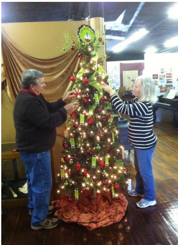
Hoe'n in Euharlee