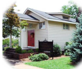
The Garden Center is located at 100 E. 8 th St.

The new member to the federation (Hoe’n in Euharlee) will be added soon. Also please communicate with Don and Judy Howerton to include photos or updates on your garden club.