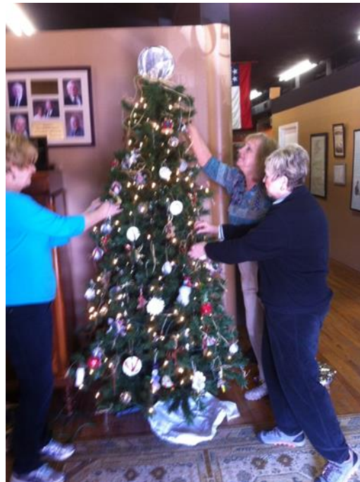
Spade and Trowel

Thank you for your participation in the annual Christmas tree decoration activity at the Rome Area History Museum.