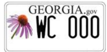
The new Purple Coneflower License Plate

In the spring of 2007, Georgians witnessed daffodils bursting from the ground alongside major expressways. In an effort to extend the window of blooming flowers along the roadsides, Georgia DOT landscape architects chose daffodils which require little maintenance and are simple to plant.