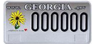
Black-eyed Susan License Plate

Following legislation in 1998 and 2001, the Georgia DOT partnered with the Garden Club of Georgia, Inc. to design and manufacture the Wildflower Auto Tag. The auto tag created by Georgia DOT Artist Stan Smith features the Black-eyed Susan which was chosen based on its extensive familiarity among Georgians.